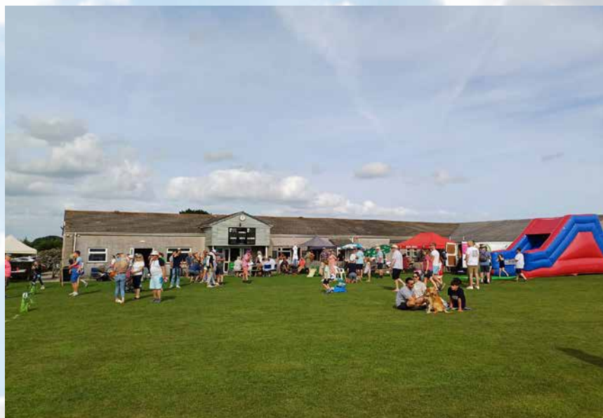
The sun shining at the Veryan Country Fayre

Do you know anyone who would like to receive our newsletter? Do you have an interesting story to share? email: veryanparishnewsletter@gmail.com