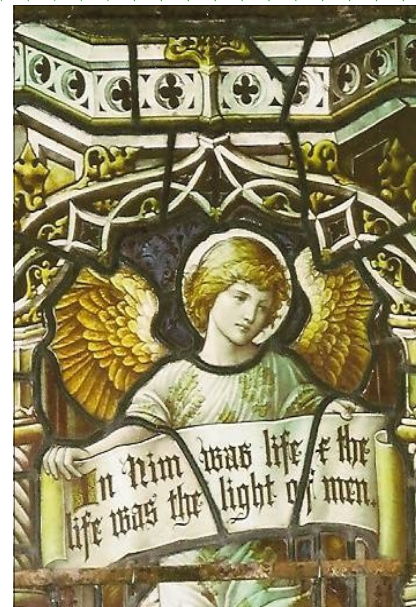
Detail from the east window, Veryan

Christmas Day RUAN LANIHORNE: 9.30 am Holy Communion; VERYAN: 11 am Eucharist